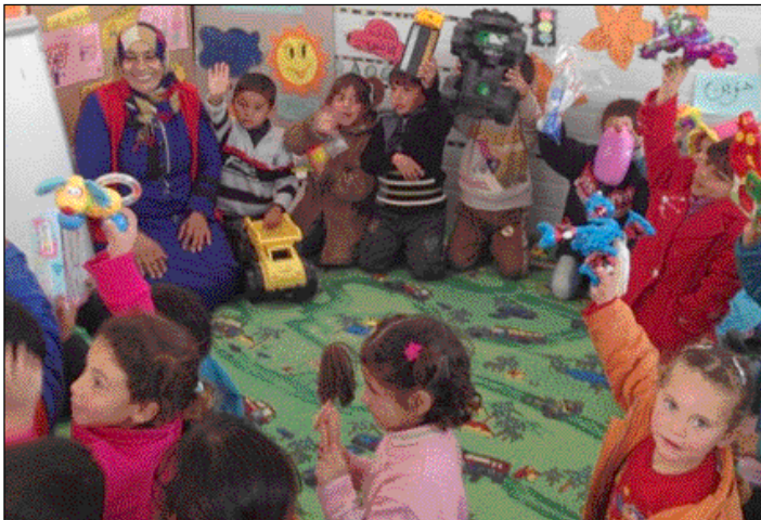
• Children receiving toys.